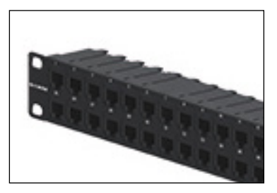
High density version provides 48 ports in just 10 to reduce valuable rack space consumption