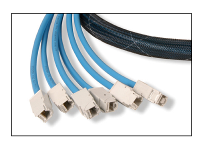
Leverage the quick-snap design by combining Z-MAX trunk assemblies with empty Z-MAX patch panels