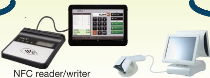
NFC reader/writer Magnetic stripe reader

Read and/or write information from e-money media.